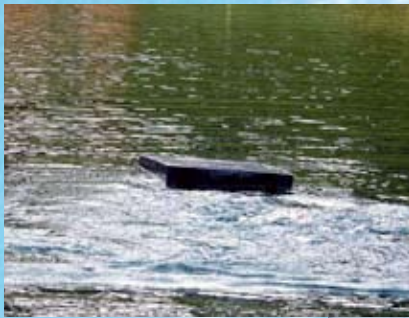
Efficiently eliminate stagnant water in ponds

EACH UNIT IS MANUFACTURED OF THE HIGHEST-GRADE INDUSTRIAL COMPONENTS IN OUR FACILITY IN WISCONSIN AND IS DESIGNED TO MEET UL SAFETY STANDARDS AS A COMPLETE PACKAGE. UNITS ARE ENGINEERED TO BE FULLY COMPATIBLE WITH SALT-WATER APPLICATIONS.