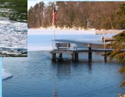
Prevent winter kill and protect structures from ice damage